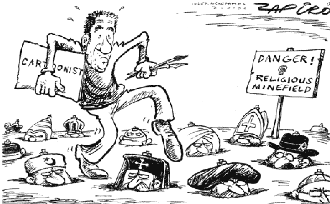
Zapiro is on leave. This is a classic rerun.